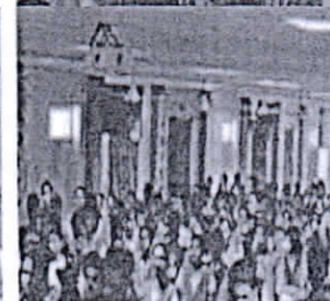
Gallery coverage of Marketing